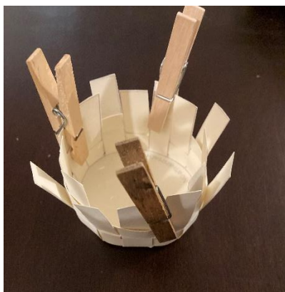
Clothes pins for layers