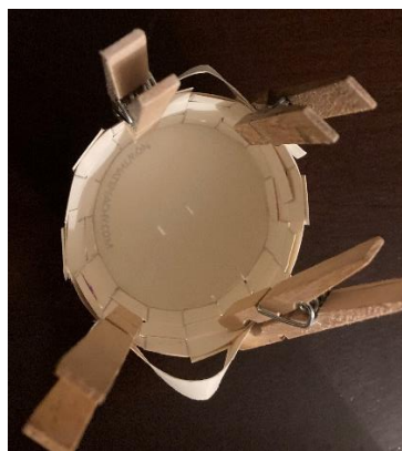
Handles on outside of basket held with clothes pins